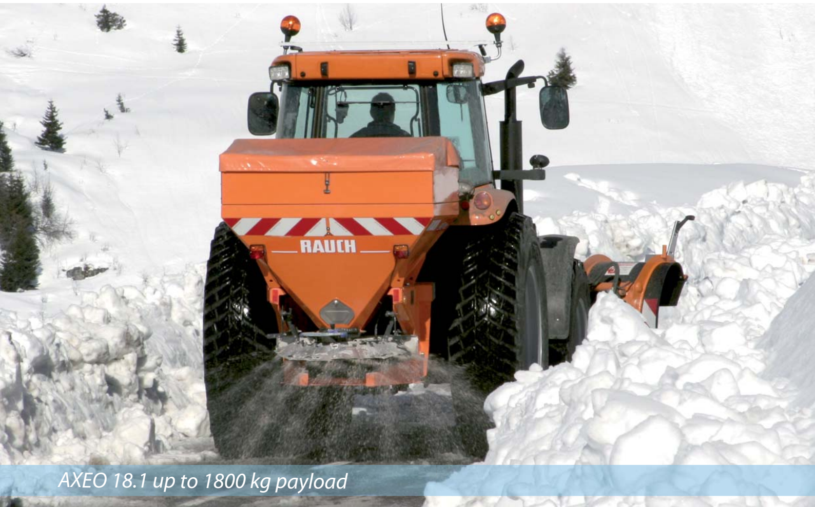
AXEO 18.1 up to 1800 kg payload