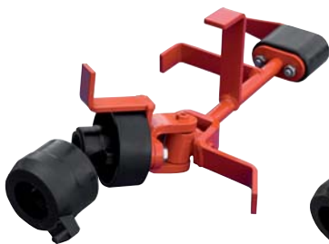
RWK AX 180 for sand/damp salt