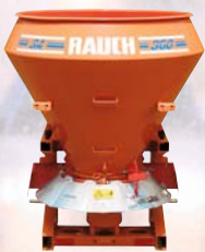
SA 121, 250, 360