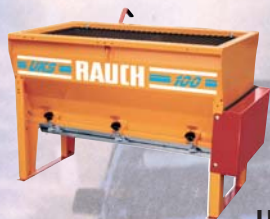
UKS 80, 100, 120