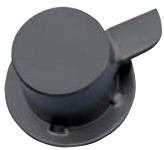
RWK AX 160 for gravel