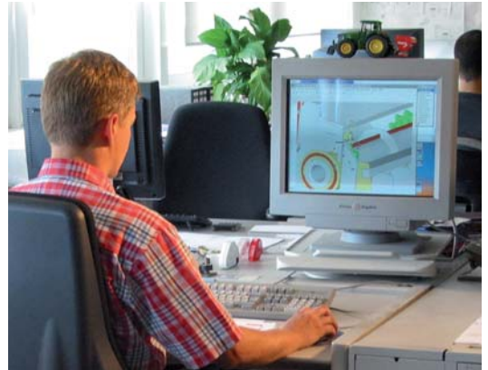
Well thought-out and planned