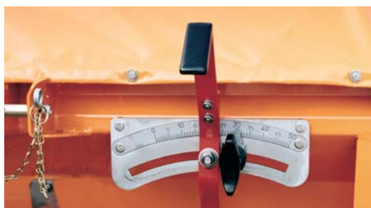
Adjustment segment: precise and convenient