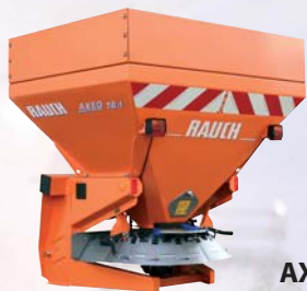
AXEO 2.1, 6.1, 18.1

Maximum safety in traffic with minimum spreading of application material