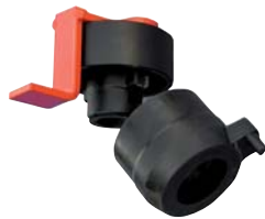
RWK AX 140 for granulated fertiliser