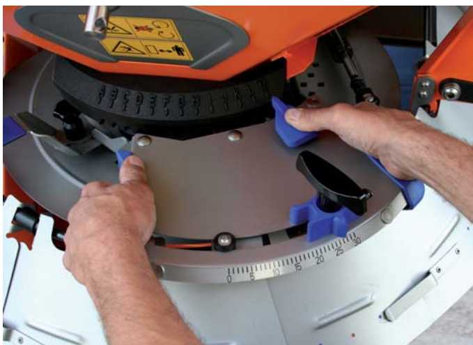
CDA setting centre - operating terminal