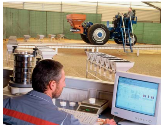
Tested and monitored