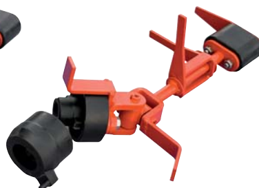
RWK AX 220 for dry salt (sacks/silo)