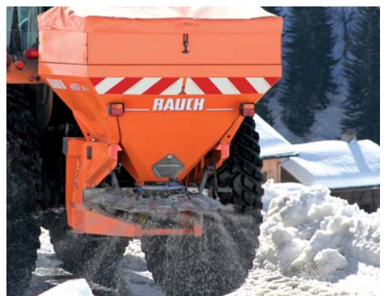
Tried and tested in practice

The modern production plant meeting the newest standards ensures enduring high quality of the machines.