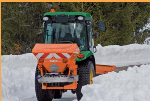
AXEO 2.1 up to 800 kg payload

The AXEO series fulfils all the requirements of a modern professional winter service: precision, high levels of operational safety, a long service life and maximum flexibility in working width.