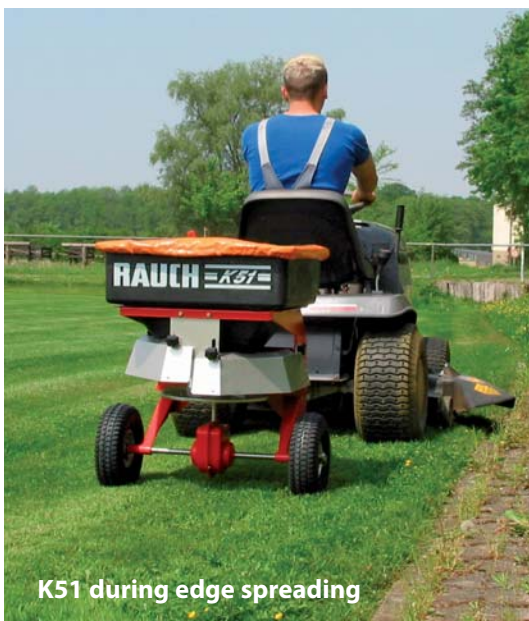
K51 during edge spreading

Typical RAUCH: High quality gearbox and important parts, such as the hopper base, slide, spreading discs, spreading width limitation and spreader vanes are made of stainless steel.