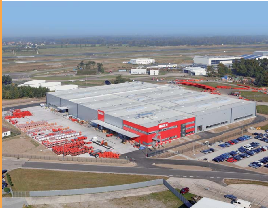
RAUCH factory at the Baden Airpark

This knowledge, gained over a period of decades, is the basis for continuous innovation and continuous development.