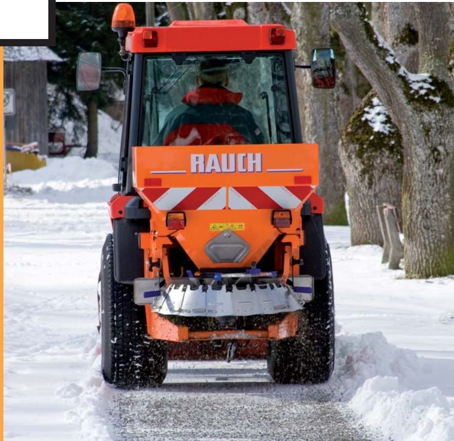
AXEO 6.1 up to 1000 kg payload