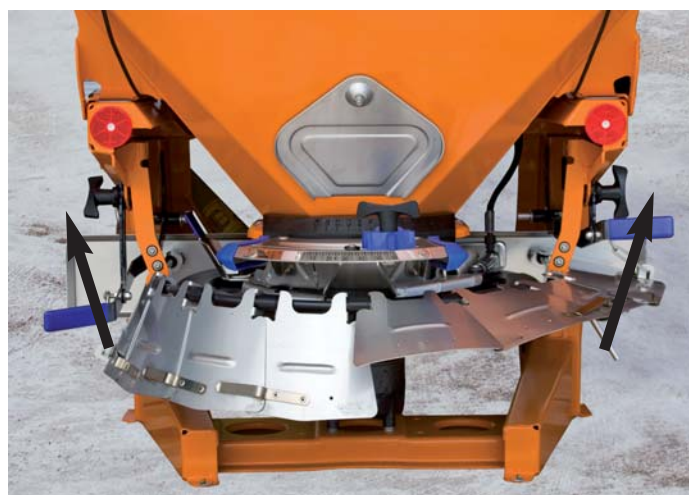
Separate spreading pattern limitation left and right

The patented AXEO "CDA" spreading concept consists of the spreading disc with eight spreader vanes and a speed of 230 r.p.m., together with a large and intelligently-shaped metering slide opening, located in the rotating hopper base. This well-designed system achieves even lateral and longitudinal distribution with steeply falling-away spreading flanks, a so-called trapezoidal spreading pattern, even at high working speeds.