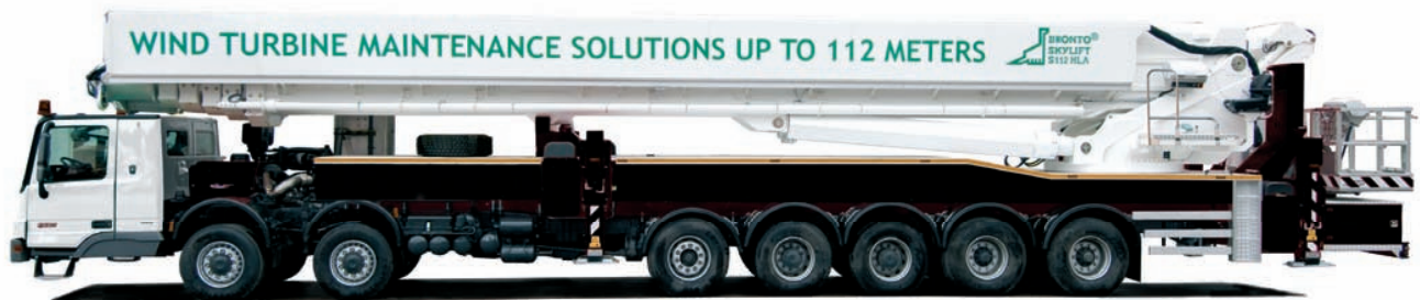
Fig. 3. S112HLA is available on all major commercial chassis.

The paramount aim of our design team has been to minimise running costs for our customers. This uncompromising approach is reflected in the easy serviceability, advanced TeleControl software and standard truck technology used for our HLA units. Reduced running cost mean increased profits for our customers. Bronto Skylift will continue to strive to offer the most economical tools to our partners.