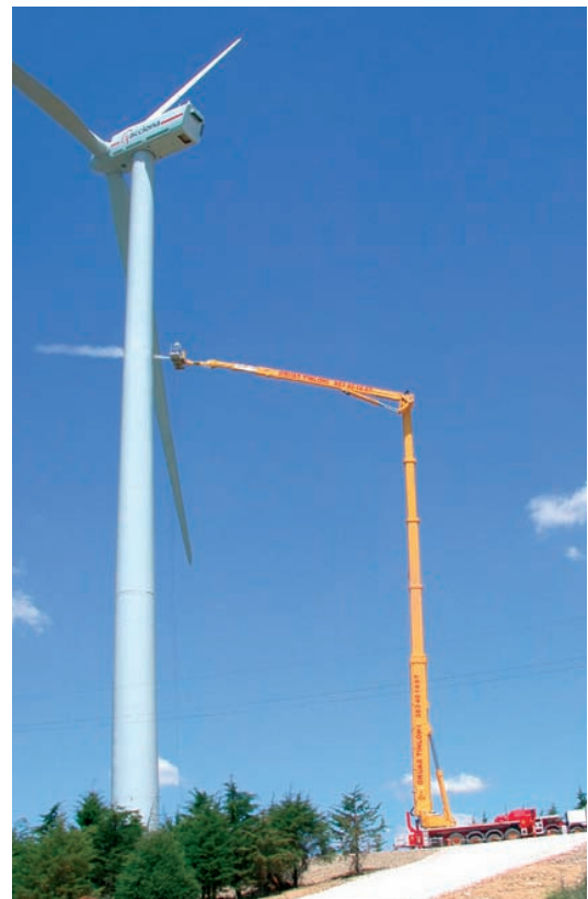
Fig. 4. S 112 HLA has the working outreach of 33 meters.

Zentrale D-84323 Massing · Mühlenweg 1 Tel. 00 49 (0) 87 24 / 96 01-0 · Fax -12 info@rothlehner.de · www.rothlehner.com