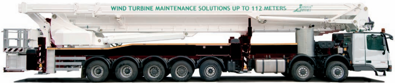
Fig. 1. The first S 112 HLA is mounted onto a Mercedes Benz 76.60 all-wheel drive chassis with 5 steered axles.