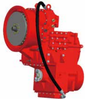
ZL50 transmission with patented technologies