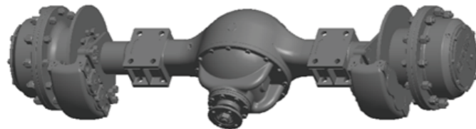
Proved XCMG exclusive drive axle