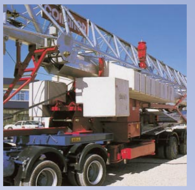
Thanks to the folding counterweight system, the weight is evenly transmitted to the axles to permit transport of the crane FULLY BALLASTED.