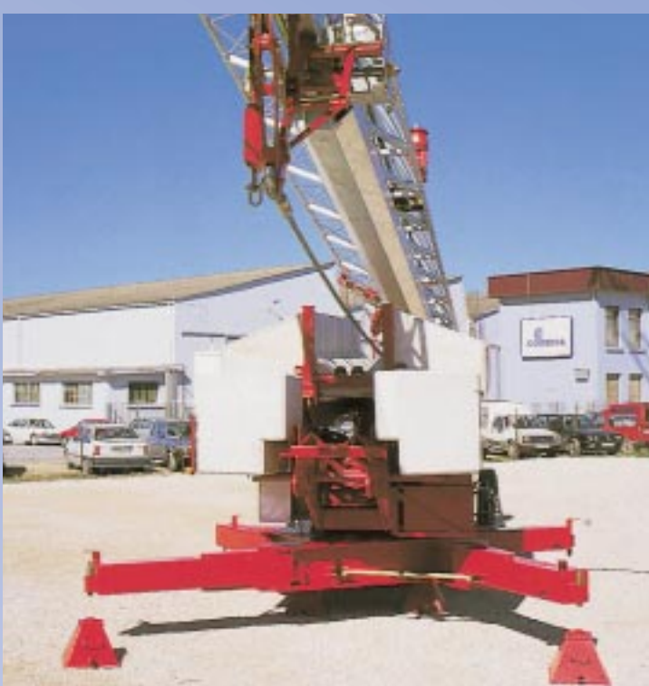
No external equipment necessary; the HT-30 is quickly and safely levelled using the central hydraulic system of the crane.