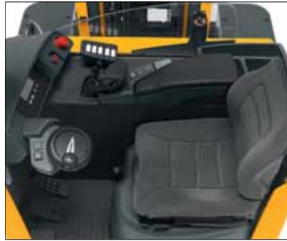
Ergonomic operator compartment