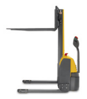
Compact drive unit for excellent maneuverability