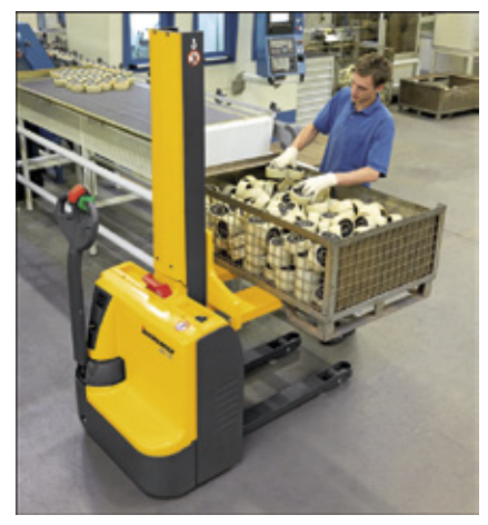
EMC 110 operating as a lift table