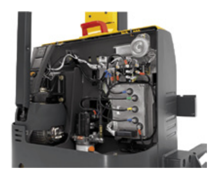
Sealed AC motor, controllers and connectors