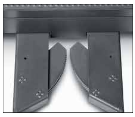
Textured tooth pallet grip