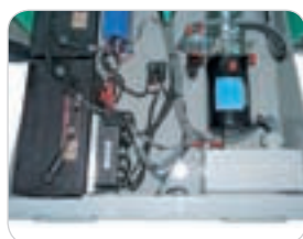
Proper and ergonomic components disposition for easier and faster maintenance task.