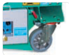
Swivel castor interlock for straight line driving.