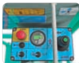
Sturdy IP65, simple and intuitive control box.