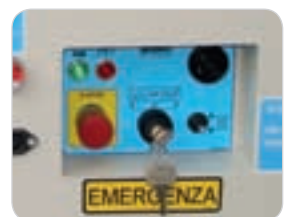
Ground control panel, intuitive and well protected from accidental bumps.