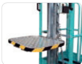
Large material tray, non-slip, adjustable in 8 positions.