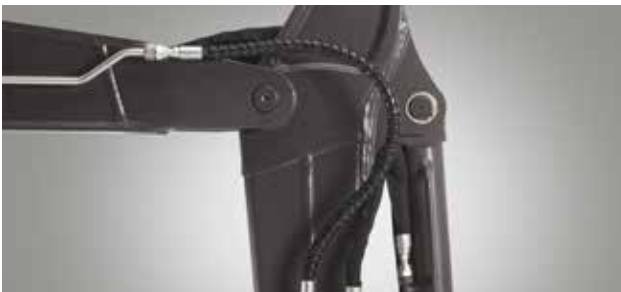
Secondary accessory circuit