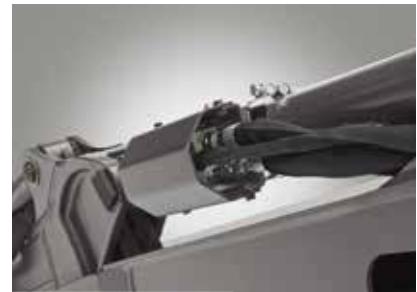
Safety valve (boom, arm and blade)