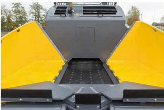
Counteract demixing – a width of 1.20 m ensures gentle material transport.