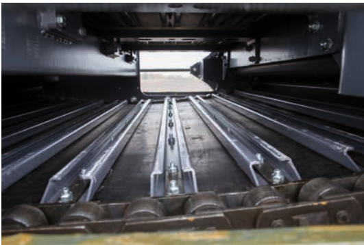
Work reliably – the chain-reinforced conveyor belt prevents downtime.