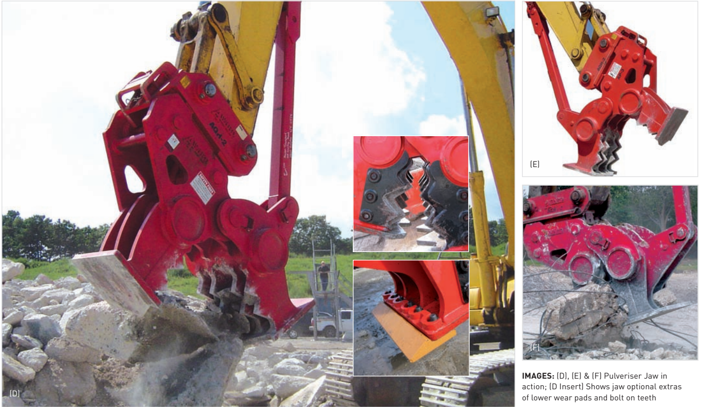
IMAGES: (D), (E) & (F) Pulveriser Jaw in action; (D Insert) Shows jaw optional extras of lower wear pads and bolt on teeth