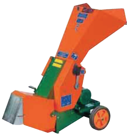
ProfiHäcksler 300K1 E7,5-H