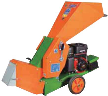
ProfiHäcksler 300K1 B9,7-H