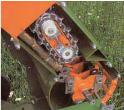
This is how ProfiHäcksler 300K1 works