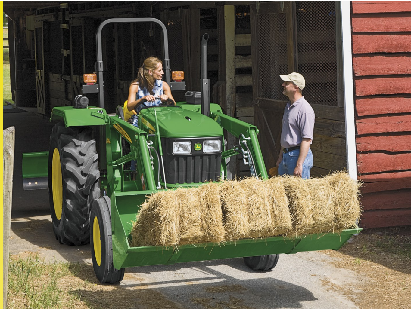
The 5D Series gives you the power and capacity you need for light hauling to medium-duty lifting and loading. 5045D Tractor shown with 512 Loader and RB2184 Rear Blade from Frontier Equipment.

And because a utility tractor is only as good as what it can lift, load, pull, or power, we gave the 5D Series 2,810 pounds of rear hitch lift capacity, an independent 540 RPM PTO, and an 10.9 U.S. gallons-per-minute implement hydraulic pump. So whether you're talking front or rear implements and attachments, the 5D Series gives you more than enough capacity and power.