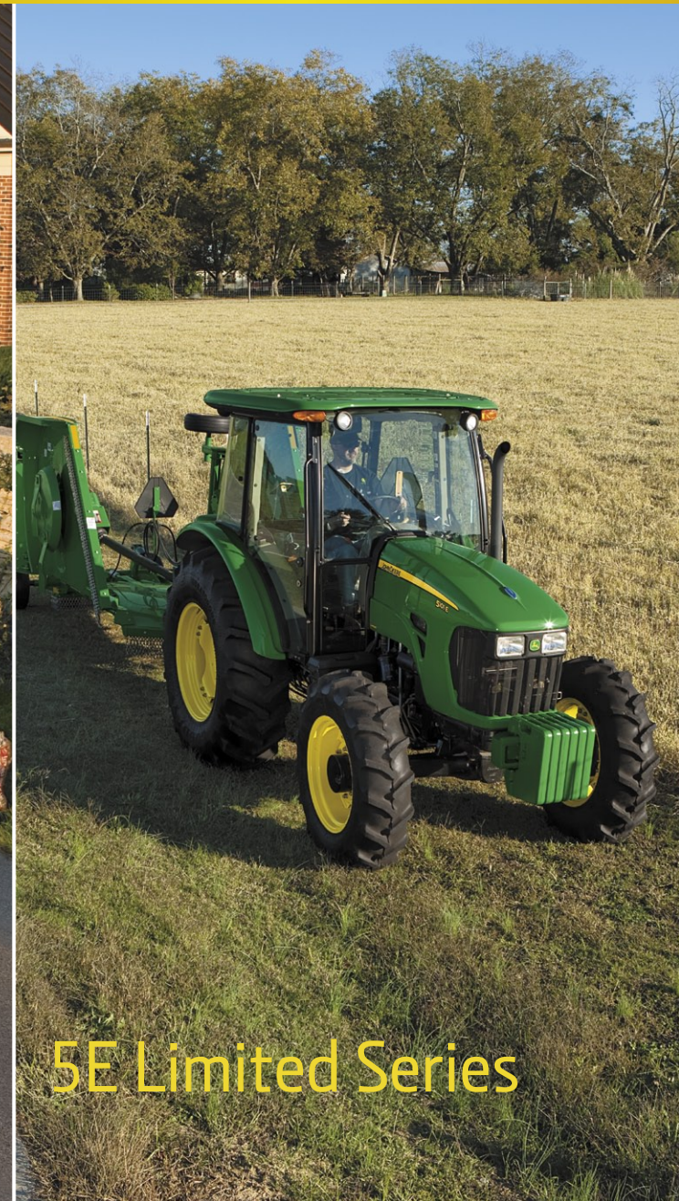
5E Limited Series