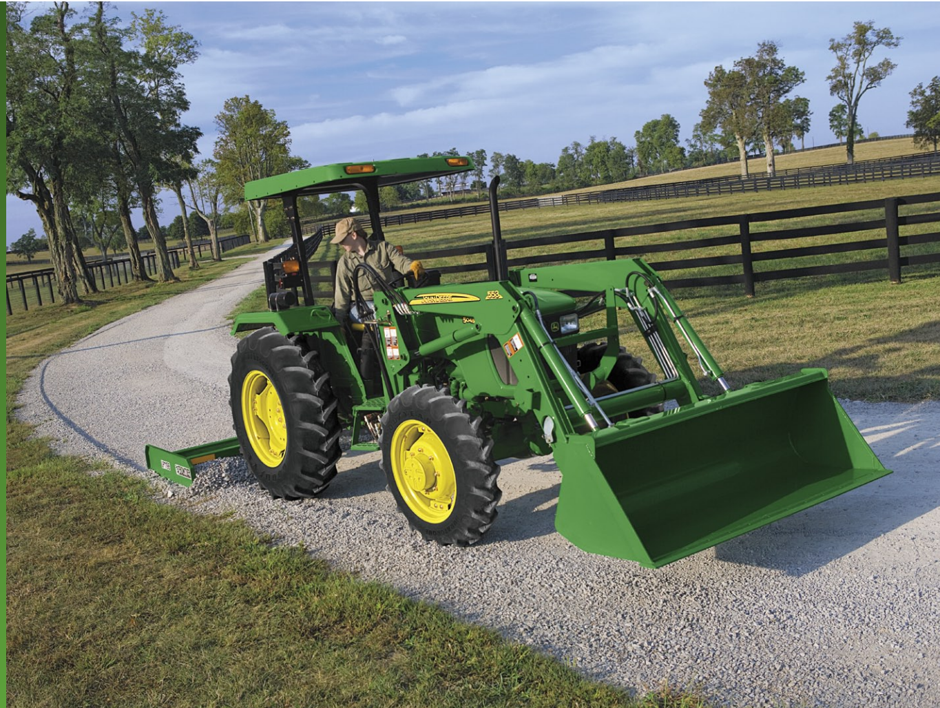
The 5E Series tractors are built to handle tougher jobs and higher-draft implements like land levelers and seeders. 5045E Tractor shown with optional canopy, 553 Loader, and Frontier LP1196 Land Plane.

Hook up to any Category 1 or Category 2 three-point hitch-mounted implement or front attachments, and you have a versatile, reliable, and economical workhorse that's up to the challenge of nearly any job.