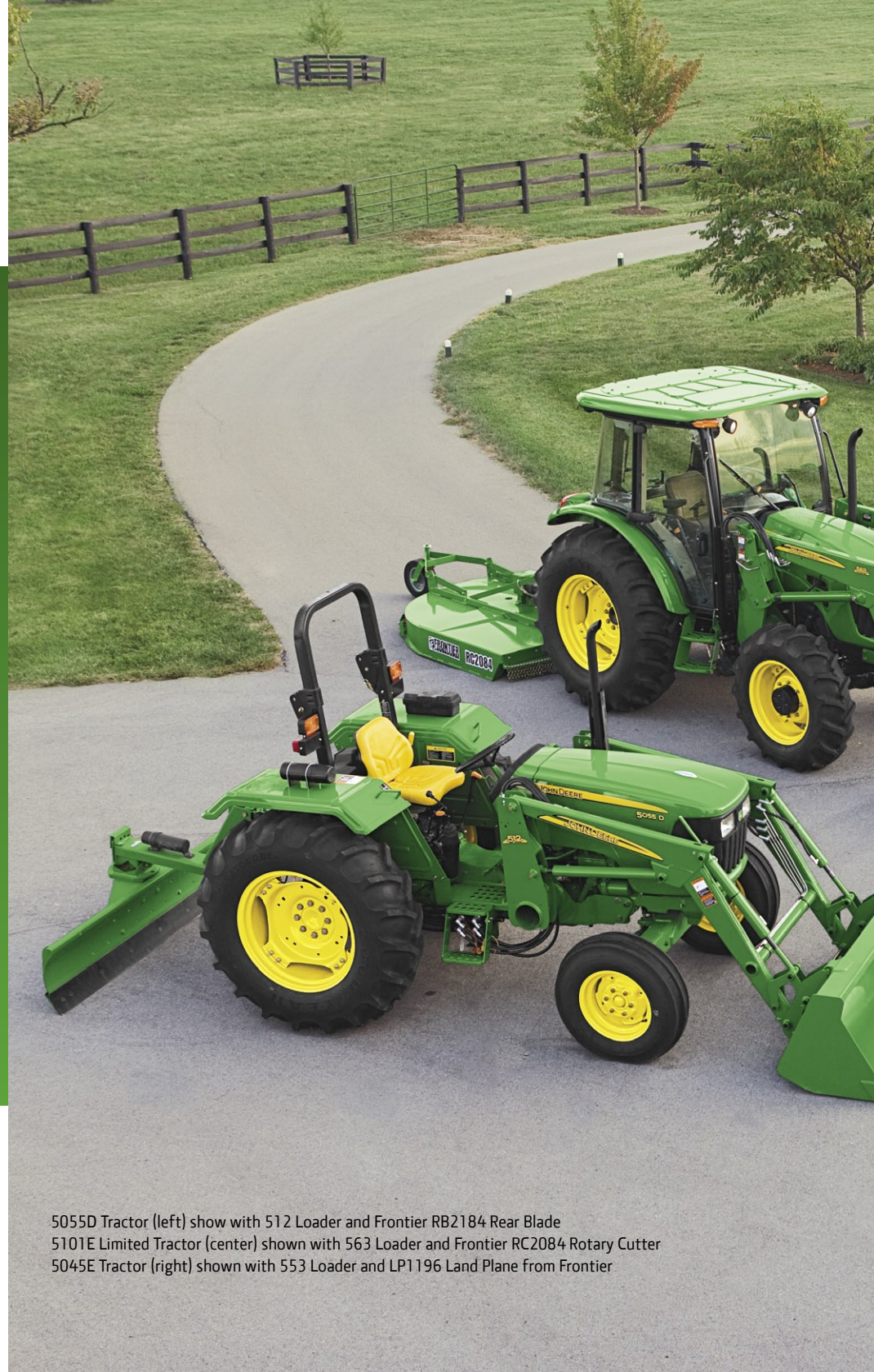
5055D Tractor (left) shown with 512 Loader and Frontier RB2184 Rear Blade 5101E Limited Tractor (center) shown with 563 Loader and Frontier RC2084 Rotary Cutter 5045E Tractor (right) shown with 553 Loader and LP1196 Land Plane from Frontier

Best of all, there are nine total models to choose from, each available at a surprisingly appealing price. Read on to learn more about the 5 Series, then stop by your John Deere dealer for a demonstration.