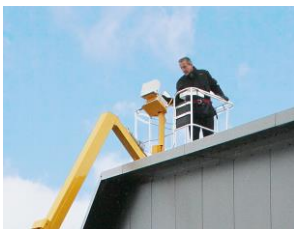
Up and over angle boom