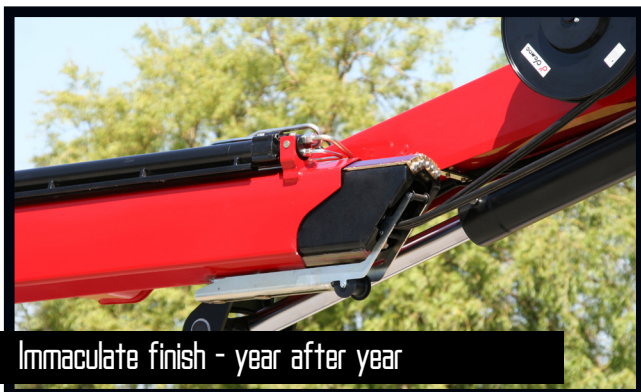
Immaculate finish - year after year

HMF's patent pending stability safety system, EVS, is continuously taking into account the current load on the vehicle so that crane and truck are in perfect balance. As the system includes the load on the truck body as a part of the tare weight of the vehicle, it means that you actually obtain a considerably larger working area with a load on the truck body - thanks to EVS. This means that you obtain both an extraordinary high level of safety and larger capacity with EVS.