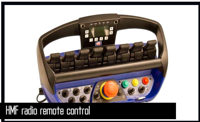
HMF radio remote control

The HMF radio remote control is part of a unique operation and safety system (TCC - Total Crane Control), which provides the operator with all advantages and possibilities for operating the crane functions and important safety functions on the HMF RCL Safety System. By means of the remote control box you can carry out many tasks besides operating the crane, independent of a fixed control position.